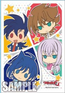
Mini Character Q4