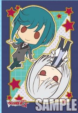
Mini Character U20 Committee