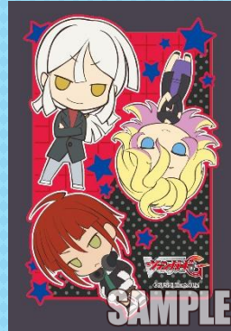
Mini Character Team Diffriider